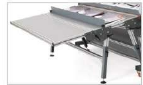
Adjustable collecting table (optional)