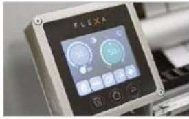
Automatic vertical alignment control panel