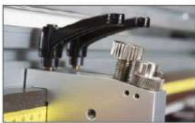
Fine pressure adjustment (according to the types of material)