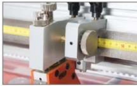
Fine positioning of the cutting blades (optional)