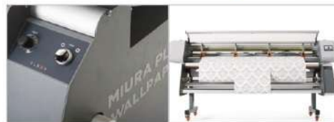
Miura II Plus WP for wallpaper: equipped with front rewinding shafts with independent clutches and speed regulator