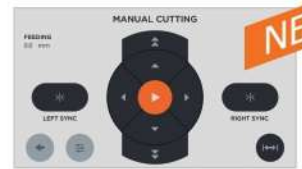
New software design for better usability