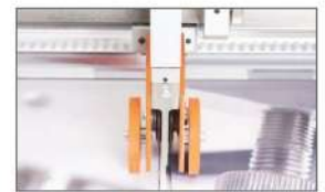
Single lengthwise rotary crush cutter (twin cutters optional)