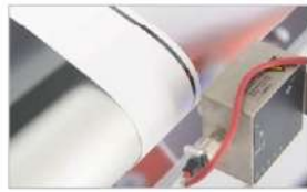
Optical sensor for vertical alignment