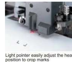
Light pointer easily adjust the head position to crop marks